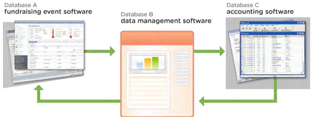
Streamline workflow from all your databases with a seamless integration.